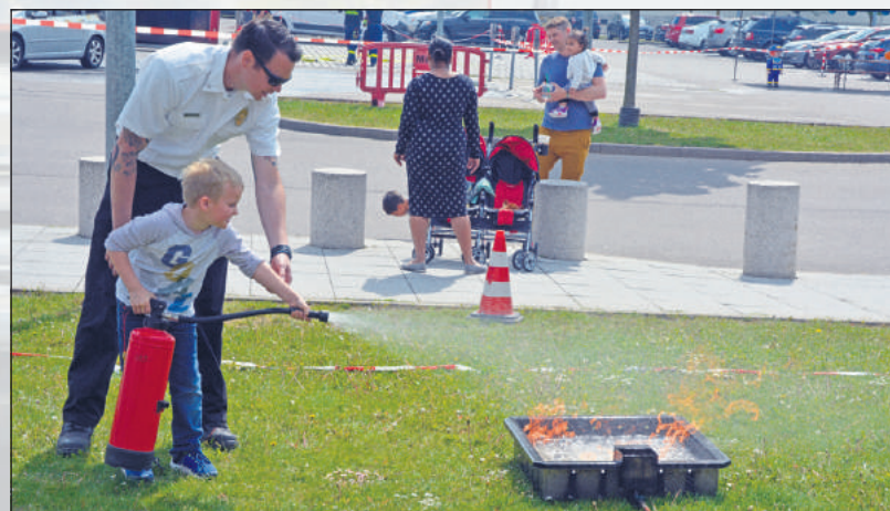
A future firefighter learns the proper use of a fire extinguisher.

for the vehicle to be enveloped in flames.