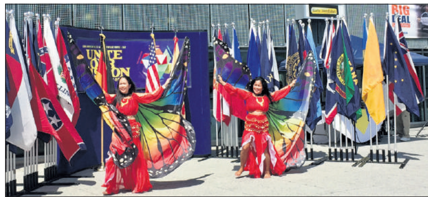
The Mi Amiga Groups perform a cultural dance at the Panzer Kaserne Exchange in celebration of Asian-American Pacific Islander Heritage Month, May 23.