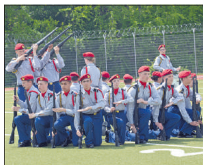
The Panther JROTC drill team goes through a synchronized move during the team exhibition event.

Seven high school drill teams participated in the competition. The Vilseck Falcons tried to be the villains who would deny the Panthers their 10th victory. The two teams' battled back and forth throughout the seven-event completion, with Vilseck holding a two-point lead going into the final event—team exhibition. Stuttgart needed to win the event to force a first