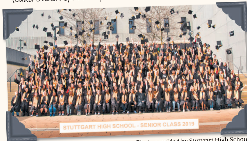
Mortarboard hats reach skyward as the 2019 class celebrates the completion of high school. The class graduated June 5.

(Editor's note: Definitions from Merriam-Webster)