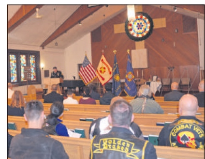
Veterans attend the USAG Stuttgart Memorial Day observance in the Patch Barracks Chapel. Many arrived by motorcycle.