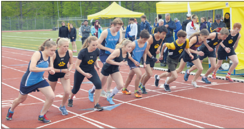
Runners begin a race during Patch's home track meet.