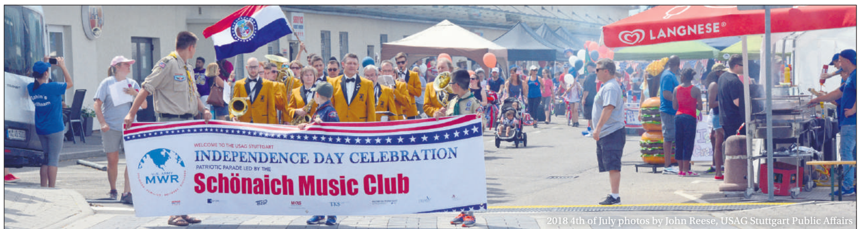
2018 4th of July