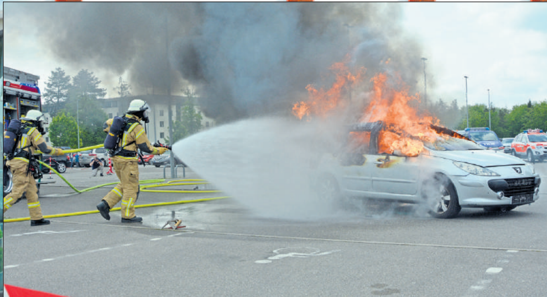
Garrison firefighters attack a car fire in a dramatic demonstration.