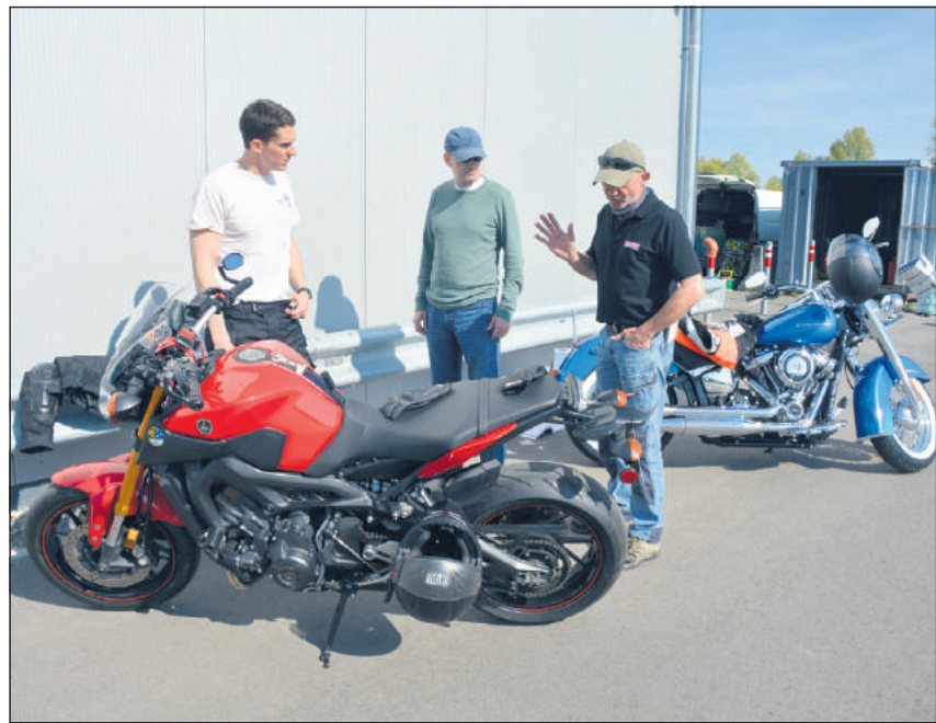
Motorcycle riders participating in a 2018 MSF Basic Rider Course learn how to perform a quick TCLOCS inspection.

Different bikes with different controls means maintenance will vary between makes and models, but some controls are universal, such as clutch and brake levers. Check the levers for ease of use and lubricate if your owner's manual calls for it. Flick the assorted switches, such as the horn, high/low beam, kill switch, turn signals and starter. Inspect all