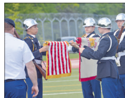
The color guard performs its routine under the watchful eye of the judge, May 18.