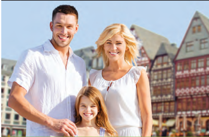
Event calendar • travel articles • movie schedules • tips • videos • recipes and more at MilitaryInGermany.com