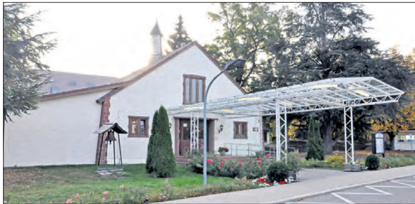
Patch Chapel

Now I live in Germany, a land full of pine trees, snow covered hills,