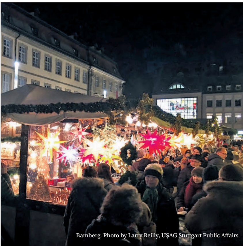
Bamberg.

Winter is upon us, and 'tis the season for colorful markets with maroni, or chestnuts, roasting on open fires. Find your market with the handy guide on p.8.