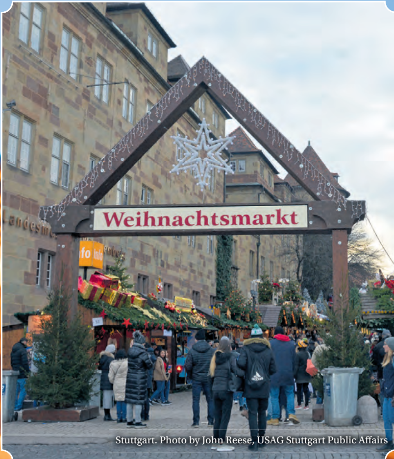
Stuttgart.