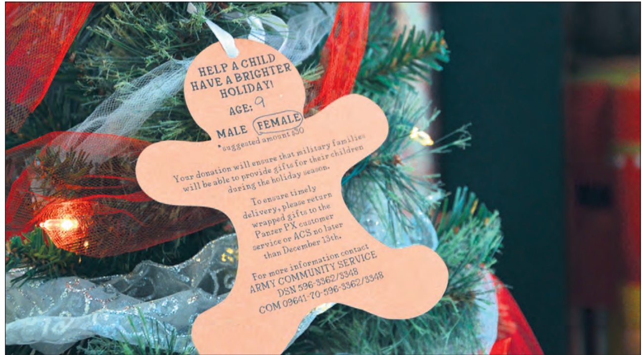
A paper gingerbread man with information about a child within the Stuttgart military community awaits a sponsor.

"Those are some of the hardest years of being a kid, and being