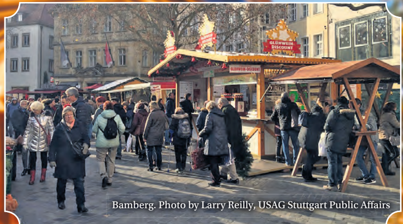
Bamberg.