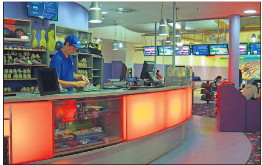
The Galaxy has everything new or experienced bowlers need, including fitting and drilling new bowling balls and other equipment.

Einhorn said the community is invited every Saturday for black light cosmic bowling. After 5 p.m, when you get a strike with a red pin in the number one position, you win a free game.