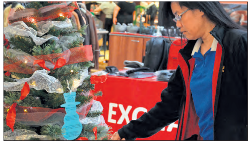
Community members passing the tree before entering the Panzer Exchange may read and choose an angel for a boy or girl, purchase a requested gift, and deliver it to ACS in time for Christmas.

For more information, call 596-3362 or 09641-70-5963362.