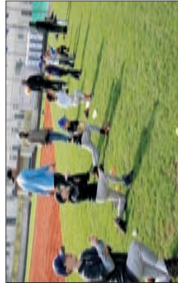
Boys and girls between 3 and 10 years of age learn to throw a baseball at the CYS Services Baseball Clinic April 17 on Husky Field.