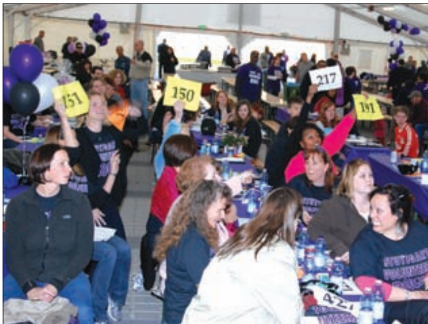
Volunteers join in a bidding war to win prizes with their "volunteer bucks" during the volunteer auction, following the Volunteer Recognition Ceremony April 22.

For the volunteers, however, these accolades are just icing on the cake. They do the work for other reasons.