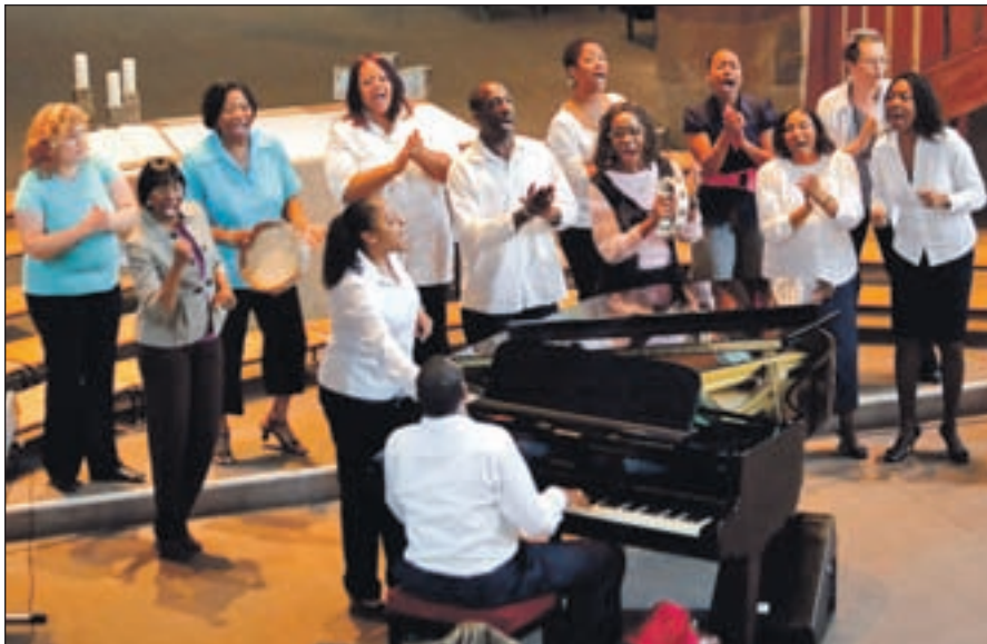
Members of the Panzer Gospel Choir perform at Leonhardskirche in downtown Stuttgart during American Days 2009.

"The close relationship between Stuttgart and the