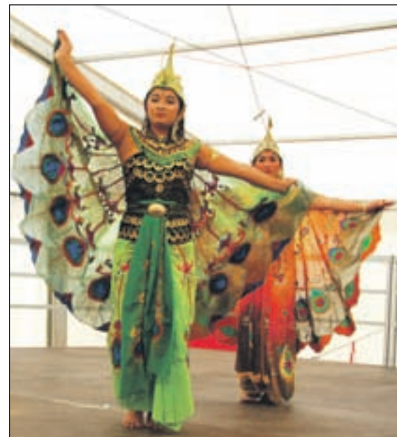
Members of the Indonesian culture group, Kridha Budaya Sari, perform a traditional dance depicting peacocks during Diversity Day May 6.

Other agencies, including the United Service Organizations and American Red Cross, also supported the event with informational booths. Food samples and a variety of lunch options, from lumpia to steak,