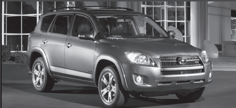
2009 Rav 4