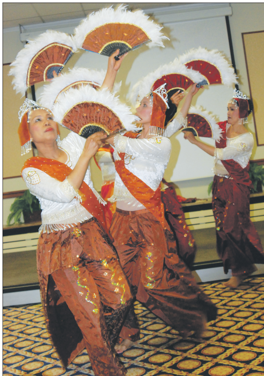
PAGASO dance group Filipino Pearl performs at the Asian Pacific Heritage Month Observance May 26 in the Swabian Special Events Center.