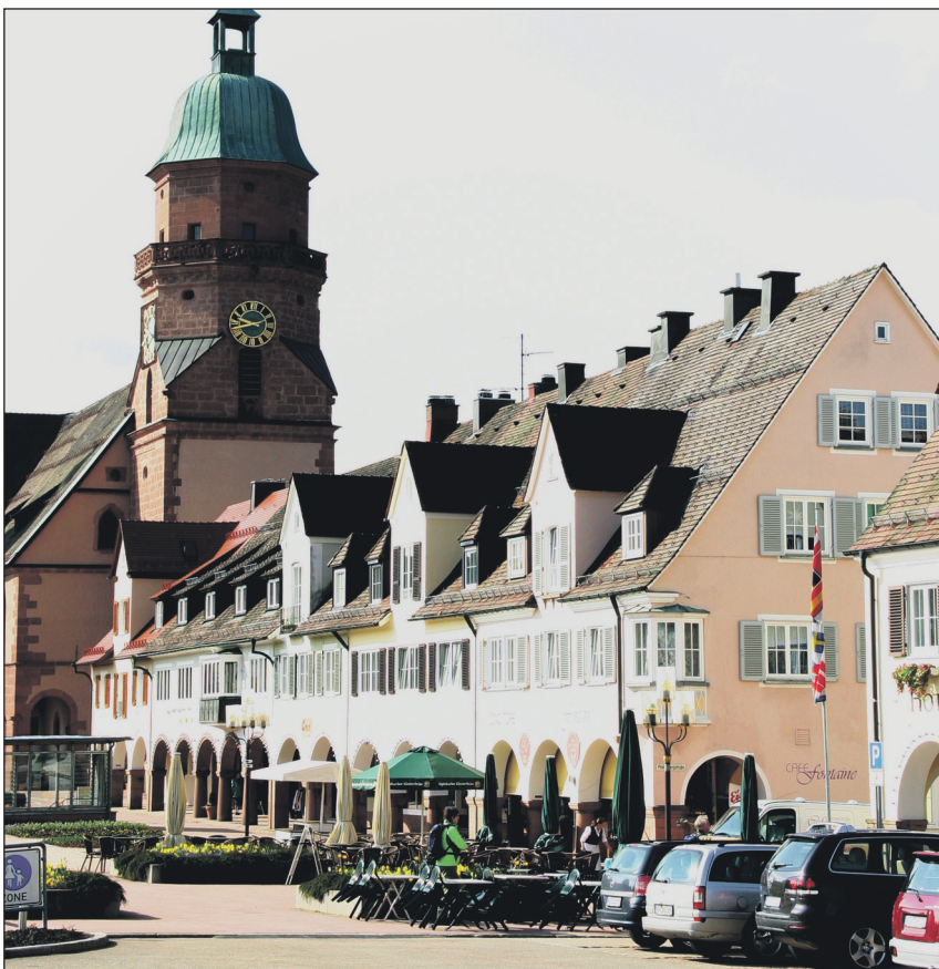
The Stadtkirche makes up one corner of Germany's largest market square.

For more information on Freudenstadt and its neighboring communities, visit www.freudenstadt.de .