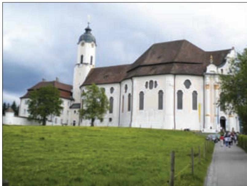
The Wieskirche, located in Bavaria's hilly grasslands, was built after a local resident claimed to see tears on a wooden figurine of the scourged savior. The church is dedicated to this statue, which can be found at the church's mercy altar.

Fifty kilometers from the village, visitors will find the Wieskirche, a church dedicated to the scourged