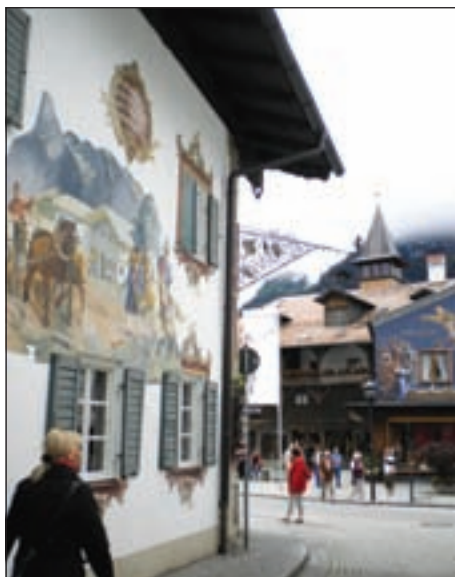
Visitors walk by one of the many houses painted with murals in Oberammergau. In the background, the Passion of Christ is illustrated on the facade of a woodcarving workshop.

Visitors to Oberammergau should also tour the woodcarving workshops,