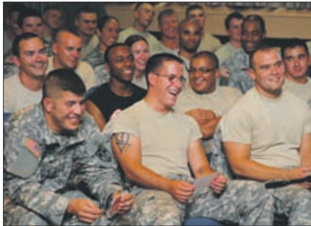
Soldiers in the 554th Military Police Company break out laughing during the Sex Signals presentation July 21.