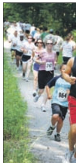
[Above] Runners in the five kilometer race make the Panzer Local Training Area. A bugler plays taps with the Run to Remember opening ceremony.