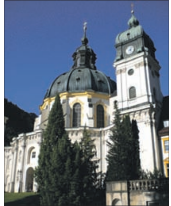
The Ettal monastery, with its Baroque cupola, is one of the most unique landmarks in the Upper Bavarian region.

A tour of Bavaria offers diverse experiences for all