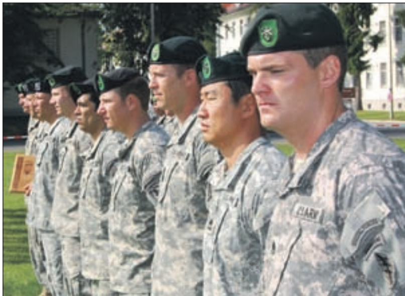
U.S. Army Special Forces Soldiers assigned to Operational Detachment Alpha 0116, 1st Battalion, 10th Special Forces Group (Airborne), stand in formation during an award ceremony in which the unit received the Larry Thorne Award for the best ODA in the command. The ceremony took place on June 28 at Panzer Kaserne.