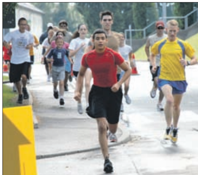
A small contingent of community members started the Fourth off with the Patch Fitness Center's 5K Firecracker Fun Run.