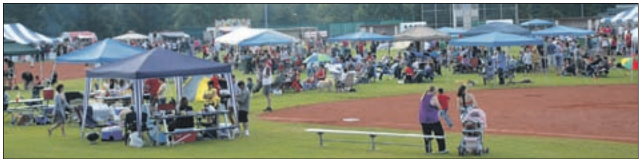
Canopies were all the rage on July 4, as people set up picnic areas and sought protection from the occasional rain shower.