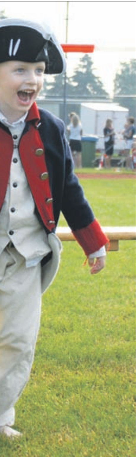
the dunk tank target on his third try, is