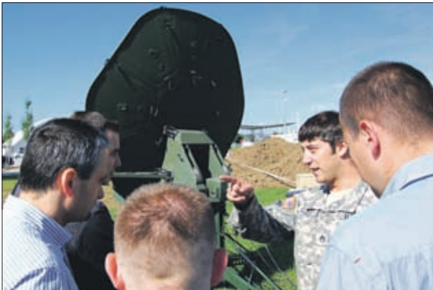
A Soldier assigned to Special Operations Command Europe Signal Detachment briefs soldier representatives of Polish Special Operations Command at Stuttgart Army Airfield on June 23 as part of a training session sponsored by SOCEUR to enhance their communications capability.

As part of SOCEUR's role in building the special operations capacity